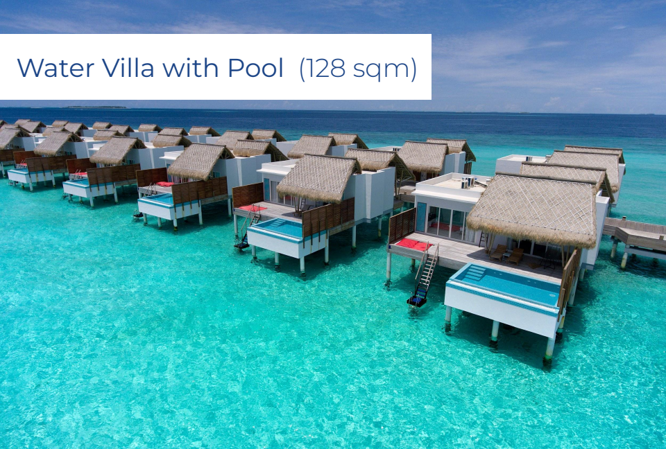
Water Villa with Pool (128 sqm)